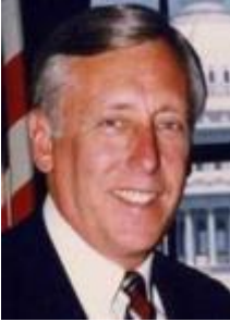
Congressman Steny H. Hoyer. (D-MD) of Maryland's Fifth Congressional District